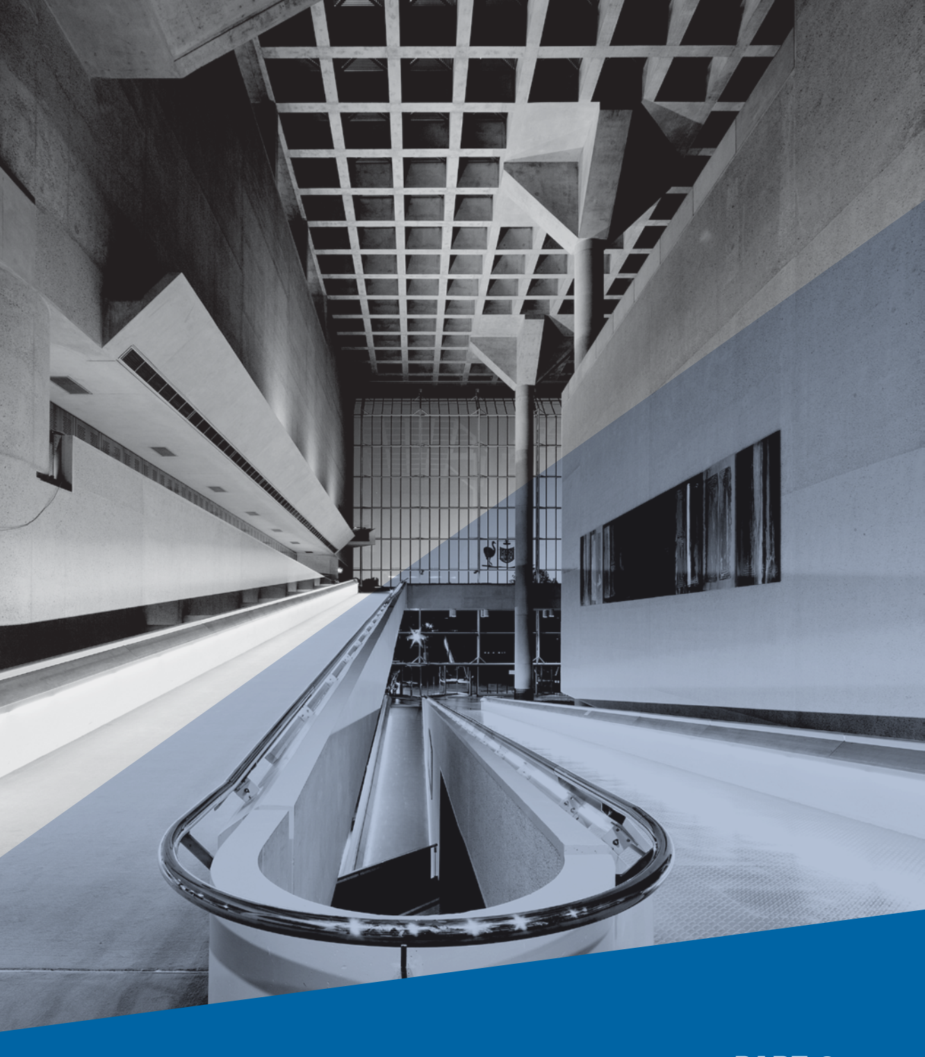
PART 6 ANNEXURES