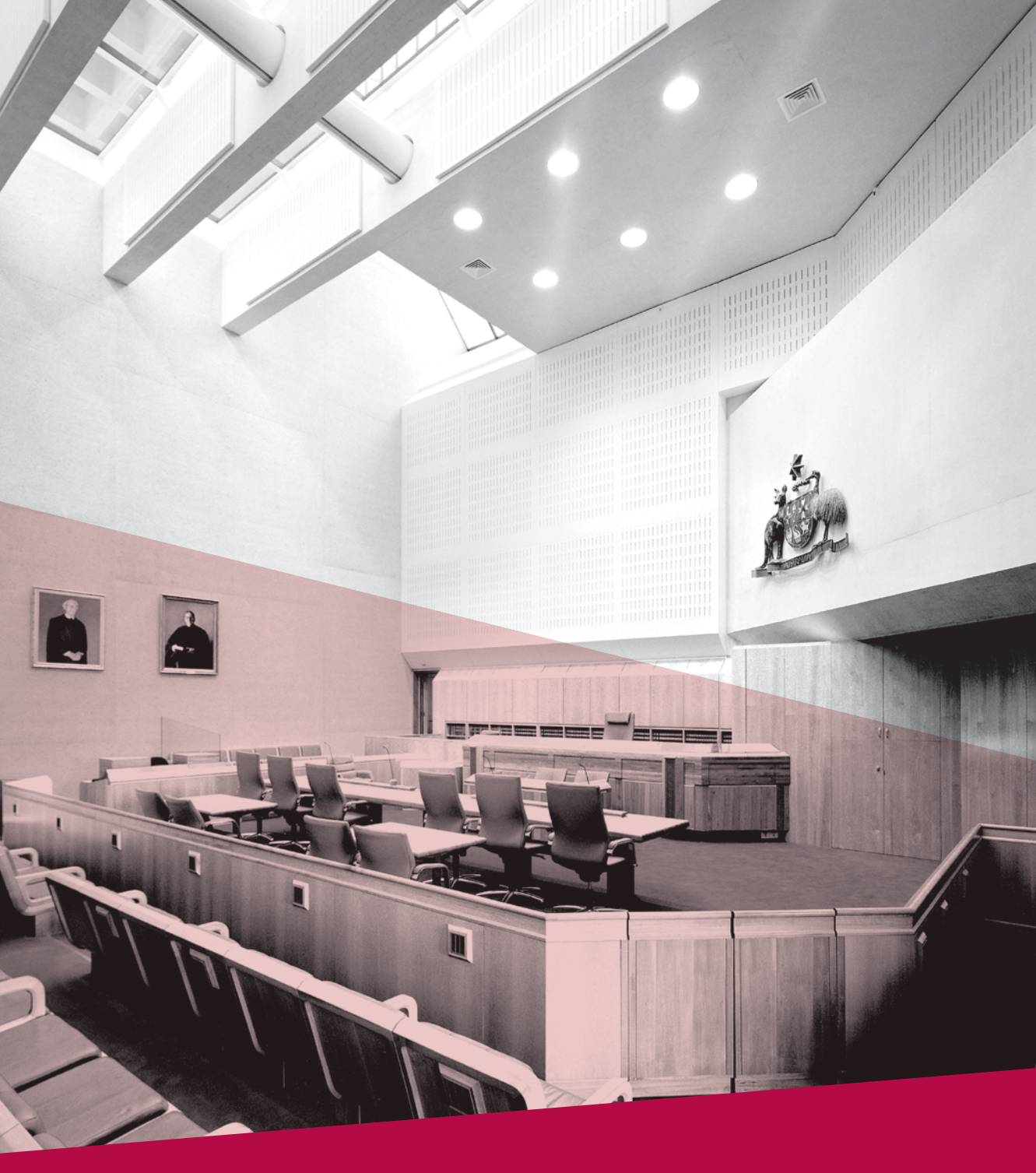
PART 2 CHIEF JUSTICE'S OVERVIEW