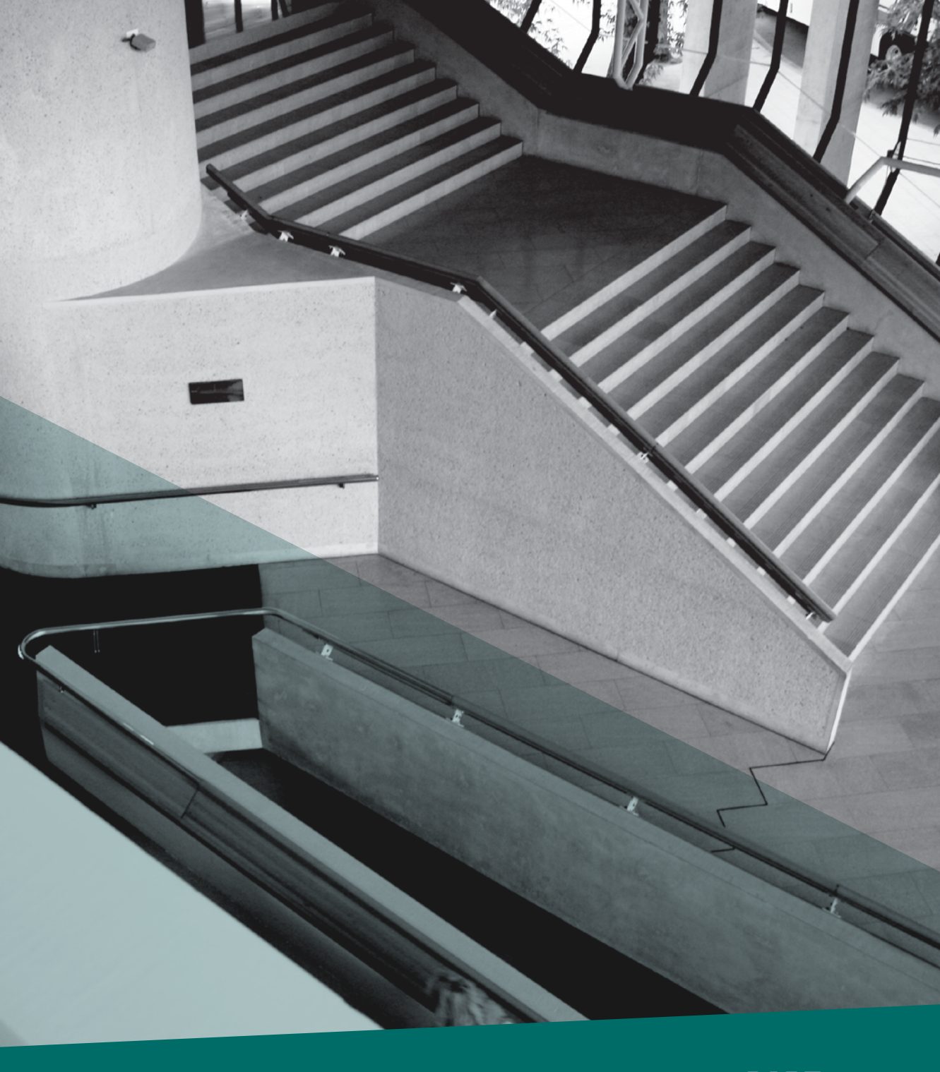
PART 5 FINANCIAL STATEMENTS