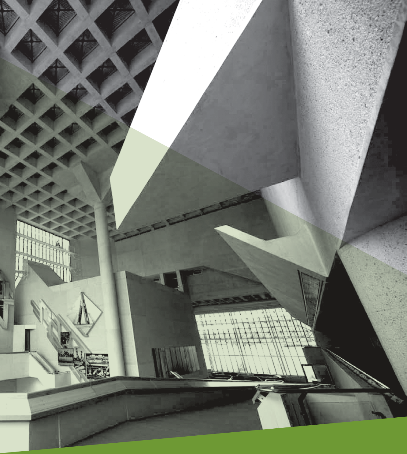
PART 3 OVERVIEW OF THE HIGH COURT OF AUSTRALIA